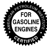
ILSAC CERTIFICATION mark

We will encourage API standard SM/EC, SL/EC or the ILSAC standard passing oil. ILSAC CERTIFICATION (Ilsaccsartification) mark is attached to the can of the ILSAC standard passing oil. -